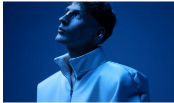
Lithuania Silvester Belt - Luktelk